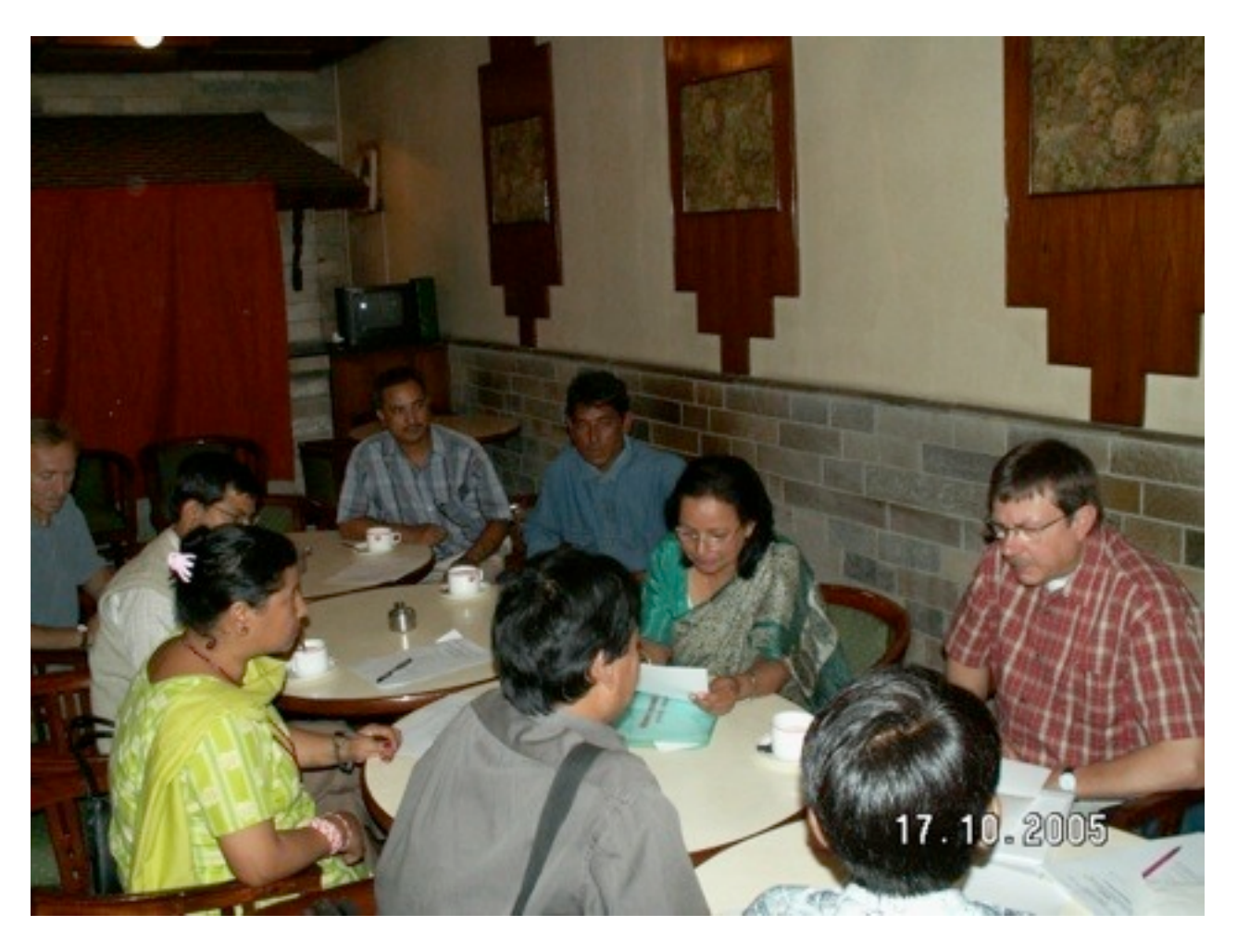
ISA 9th Congress for People who Stutter, May 2011 Buenos Aires