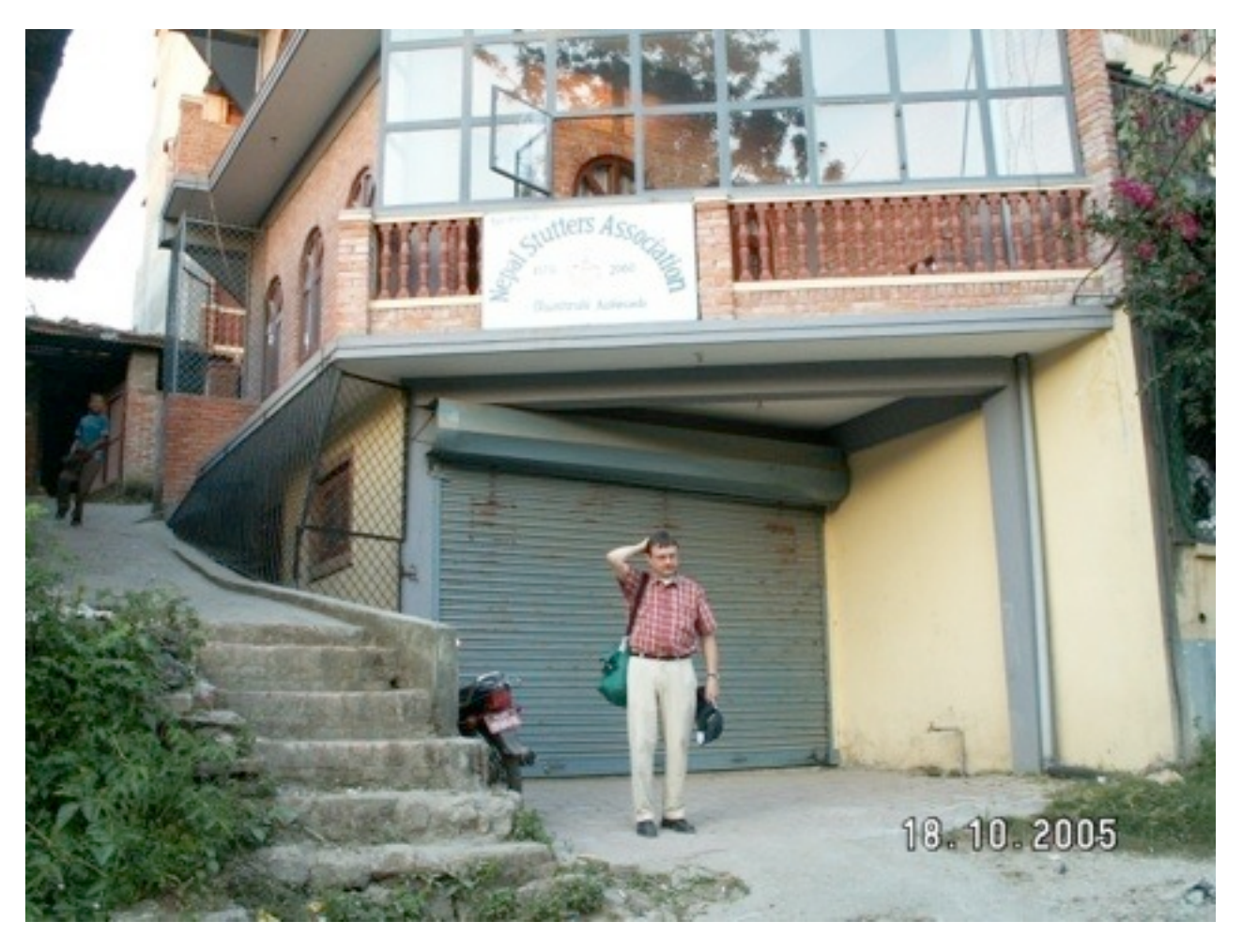
ISA 9th Congress for People who Stutter, May 2011 Buenos Aires