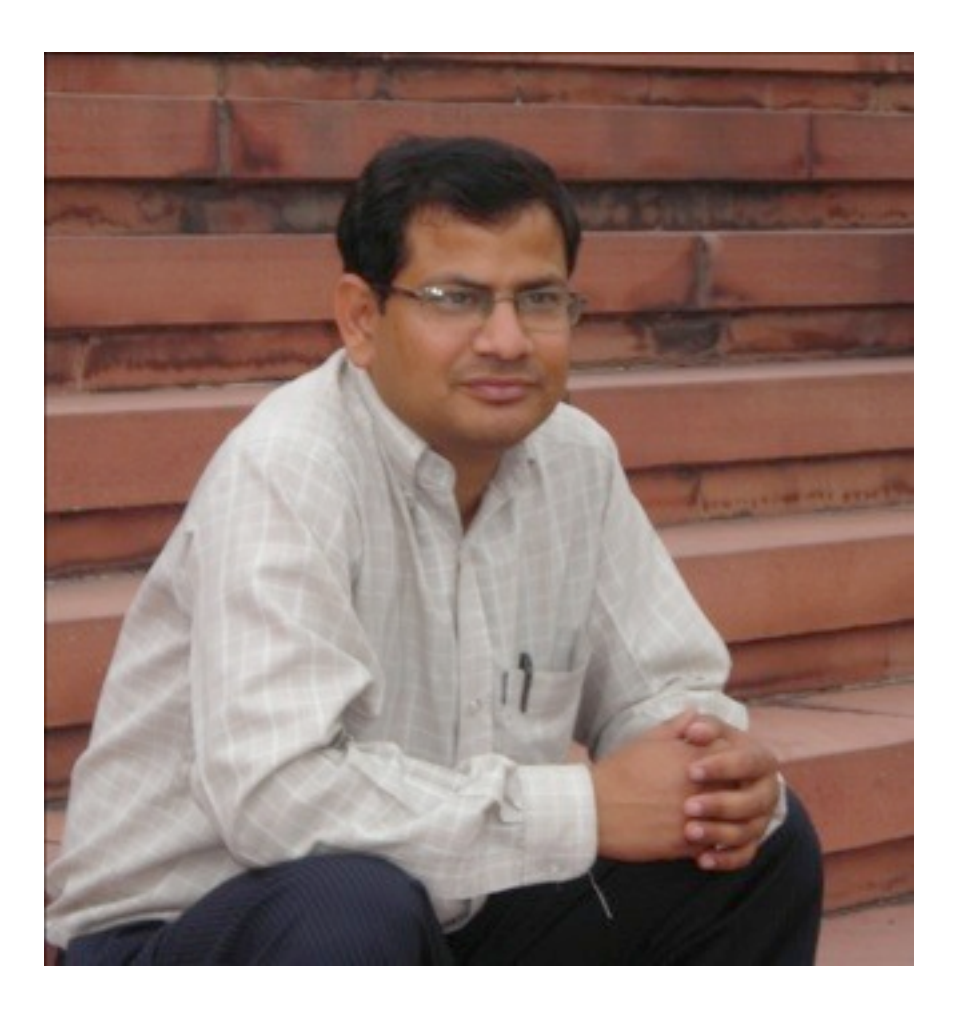
ISA 9th Congress for People who Stutter, May 2011 Buenos Aires