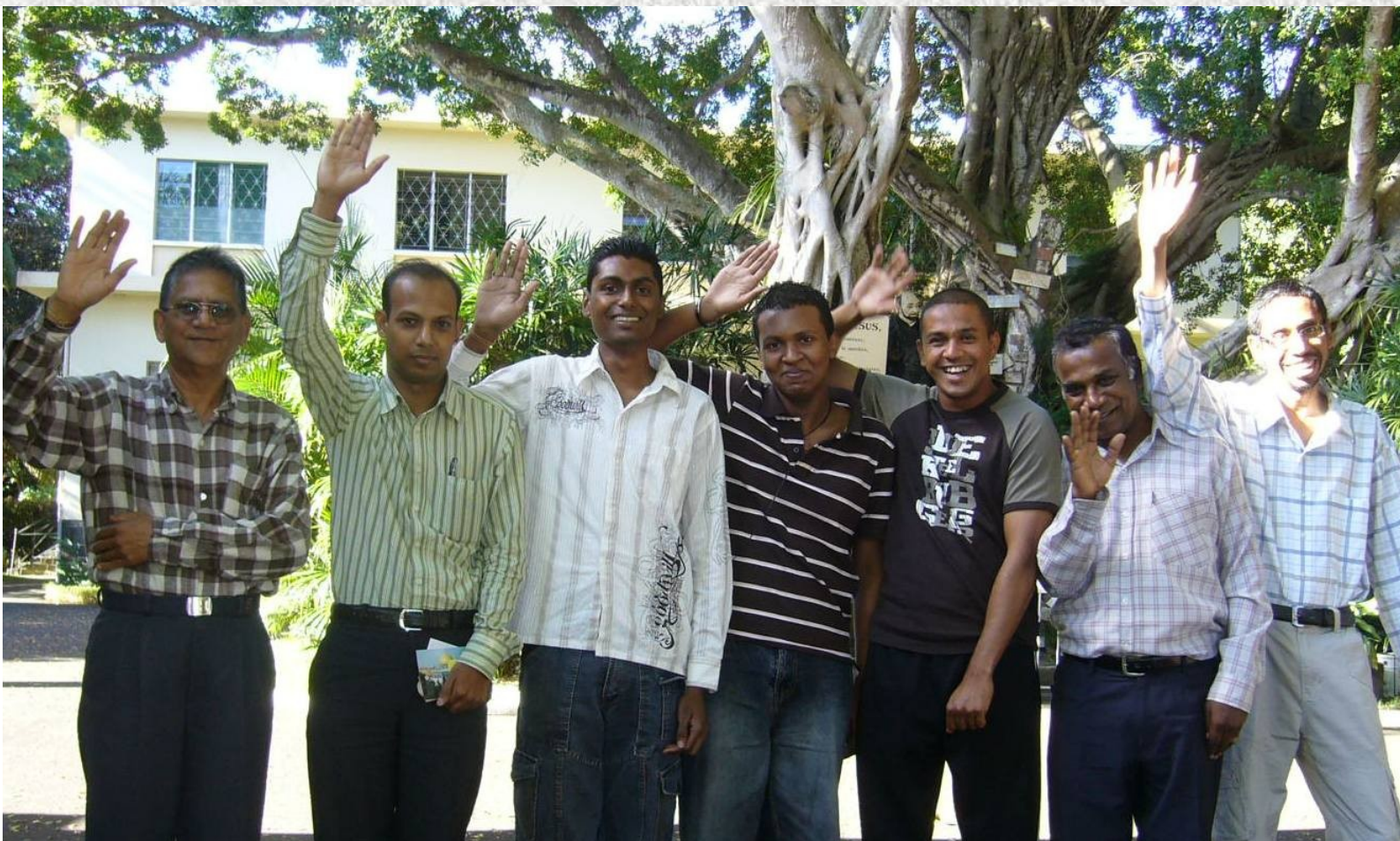
Mauritius: Friends 4 Fluency announces its winding up. See page 8.

European League of Stuttering Associations